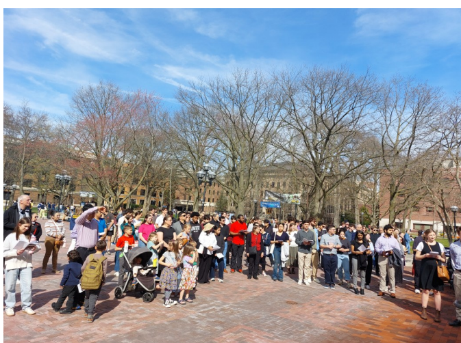
Stations of the Cross Procession through the Campus on Good Friday