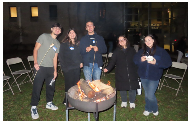
Joyful memories from the Middle Eastern Bible Study retreat on April 10.