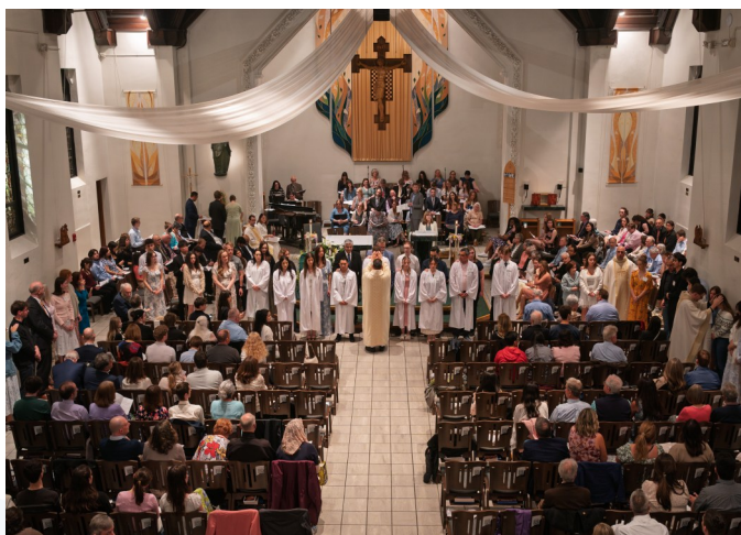
OCIA Candidates On Easter Vigil