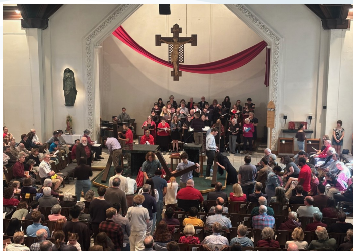
Veneration of the Cross at the 12:00 pm service on Good Friday