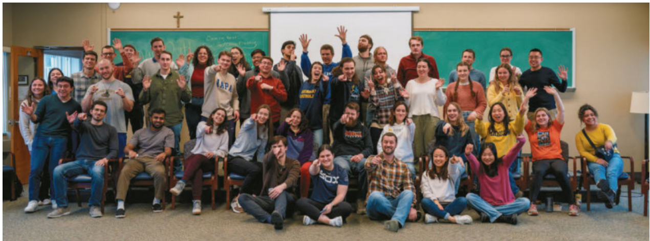
Picture of the Grad/YP Retreat at Colombiere Retreat Center in Clarkston, January 31th—February 2

May God continue to bless our graduate students and young professionals with the graces they need to establish themselves in their careers and build a life rooted in Christ!