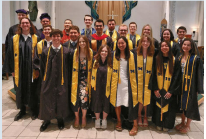
Graduation Mass, Friday May 3, 2024

Congratulations graduates and best wishes for your next adventure!