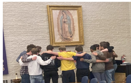
Some pictures of the retreat at the Capuchin Retreat Center, February 16th – 18th.