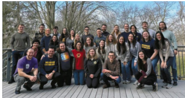
Grad/YP group at Weber Center on February 4

Taken. Blessed. Broken, Shared. This is the ongoing cycle of God’s presence and activity in the world. During this time of Lent, may you be caught by God, made holy, broken open, and offered up for the greater honor and glory of God.