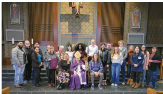
The group is pictured with some of their sponsors and the Bishop.