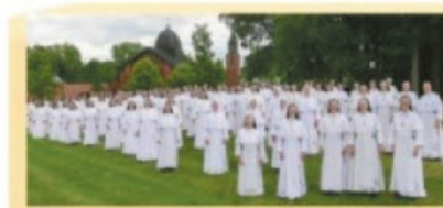
Members of The Dominican Sisters of Mary, Mother of the Eucharist will make a special appearance at the Kickoff Rally on Sunday, February 11 th !

Kickoff the Spring 40 Days for Life Campaign on Sunday, February 11 th !