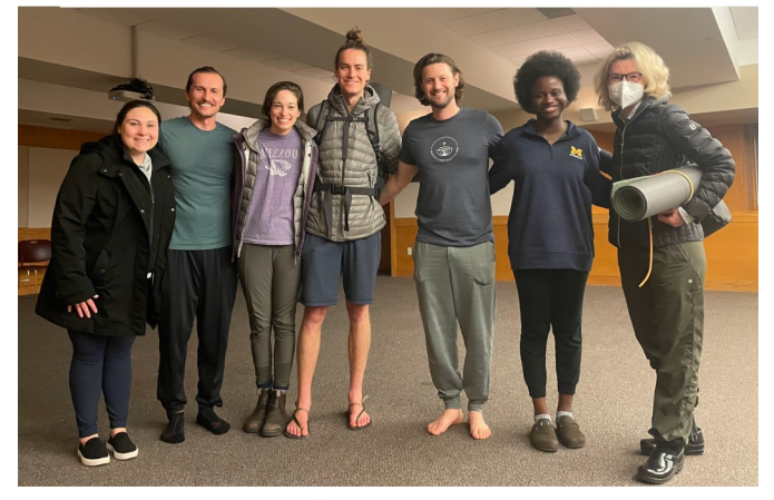
Weekend Retreat February 10–12 at the Colombiere Center in Clarkston, MI