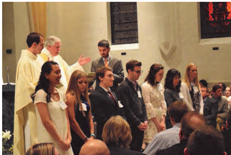
Our seven Elect stand before the congregation before their baptism.