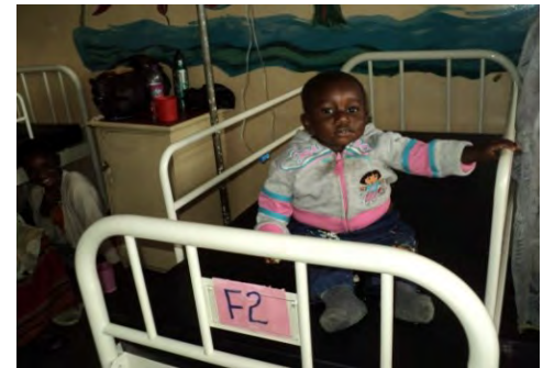
well protected child in the new beds we bought St mary's Thank you.