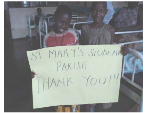
the children on the ward grateful to you.

E MAIL holyface03@gmail.com < holyface03@gmail.com >