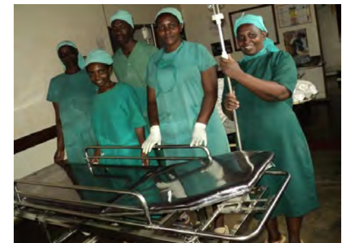
The theater team very happy to receive the patients trolley .God bless you