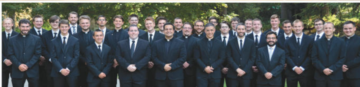
2020-2021 Diocese of Lansing Seminarians