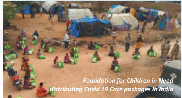
Foundation for Children in Need distributing Covid 19 Care packages in India

The Diocese of Lansing is accepting applications for two positions that serve the parishes and schools throughout the ten-county diocese. The two positions are Parish Auditor and Human Resources Generalist. To learn more about the positions and to apply, please go to the Careers page of our DOL website at https://www.dioceseoflansing.org/human-resources/careers